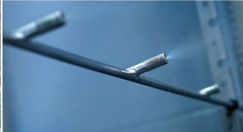
High pressure humidification